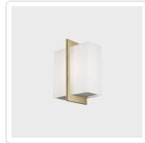
WS39210-VB Vintage Brass