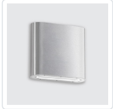
EW9106-BN Brushed Nickel