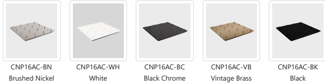
CNP16AC-BN Brushed Nickel