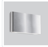
AT6510-BN Brushed Nickel