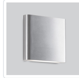
AT6506-BN Brushed Nickel